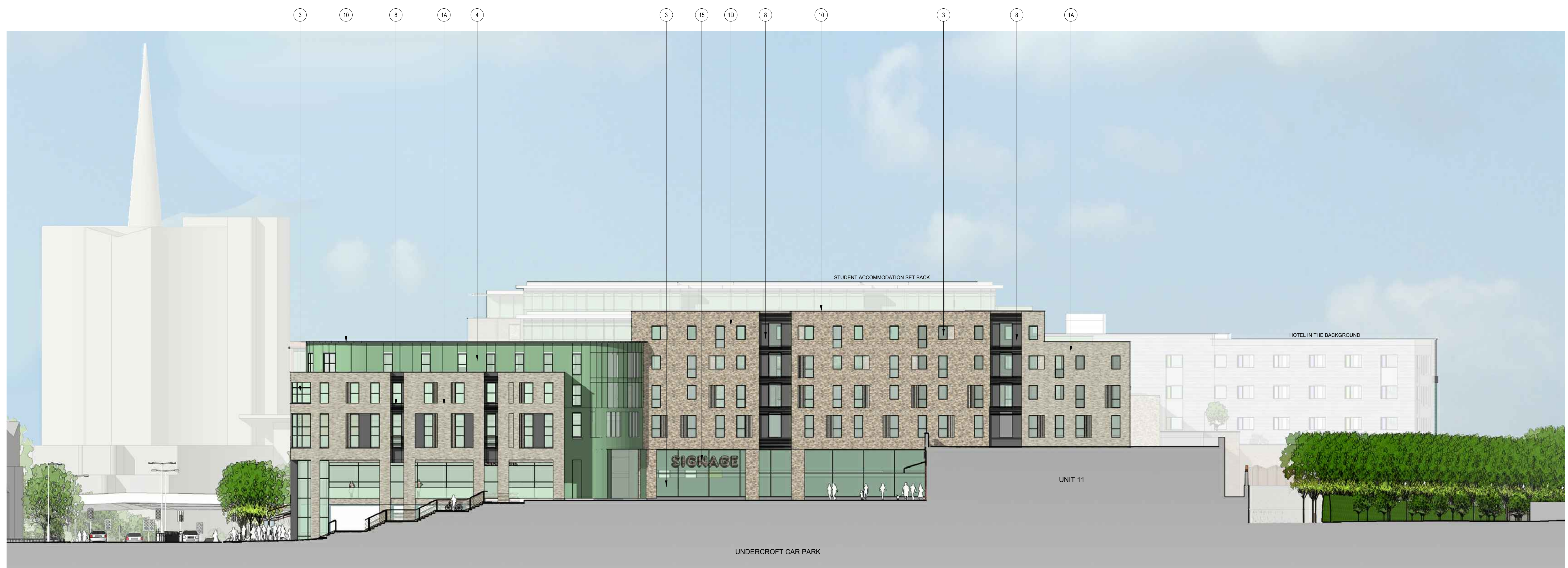
ELEVATION 12 (BLOCK B ELEVATION FACING PIAZZA)