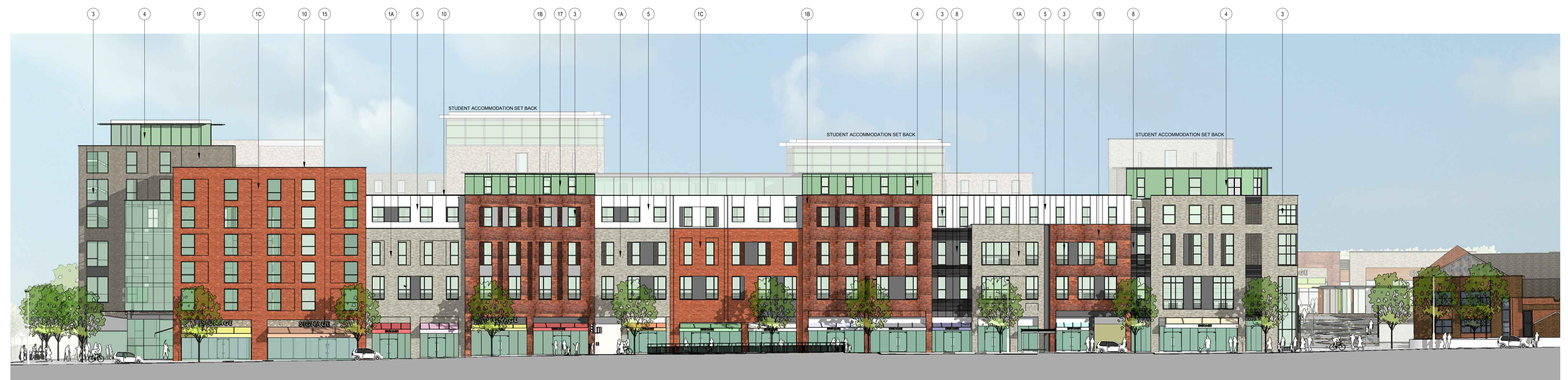
ELEVATION 13 (BLOCK B ELEVATION FACING WEST WAY)